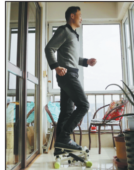
A man does exercise on his balcony in Xining, Qinghai province, on Feb 7.